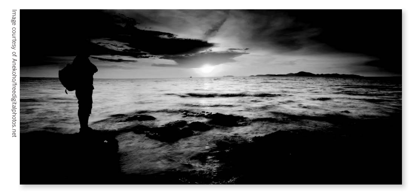
Essential Bible Truths for Children