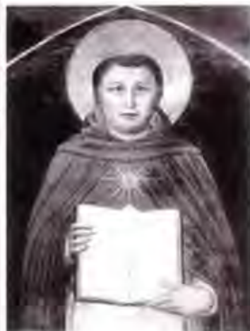
FIGURE 1.1 Thomas Aquinas

Thomas Aquinas (1225-1274) was an Italian philosopher and Roman Catholic theologian. He was a prolific writer, being credited with about eighty important works. In his work entitled Summa Theologica , he cites five arguments for the existence of God. The first one is summarized as follows: