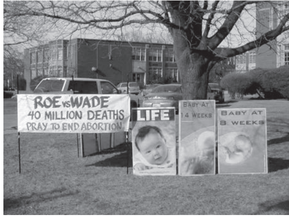
Pro-life display at Christian Liberty in the 1990s

dreds of other prisoners of conscience, he refused to sign his name to a simple form that would have allowed him to walk free. In a show of solidarity with the 25 million children that had perished in abortion clinics across America since 1973 (that was the year that the Supreme Court declared in Roe v. Wade that