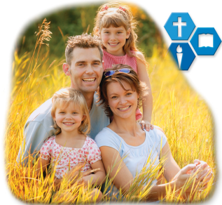
Renewing the Mind... Transforming the World