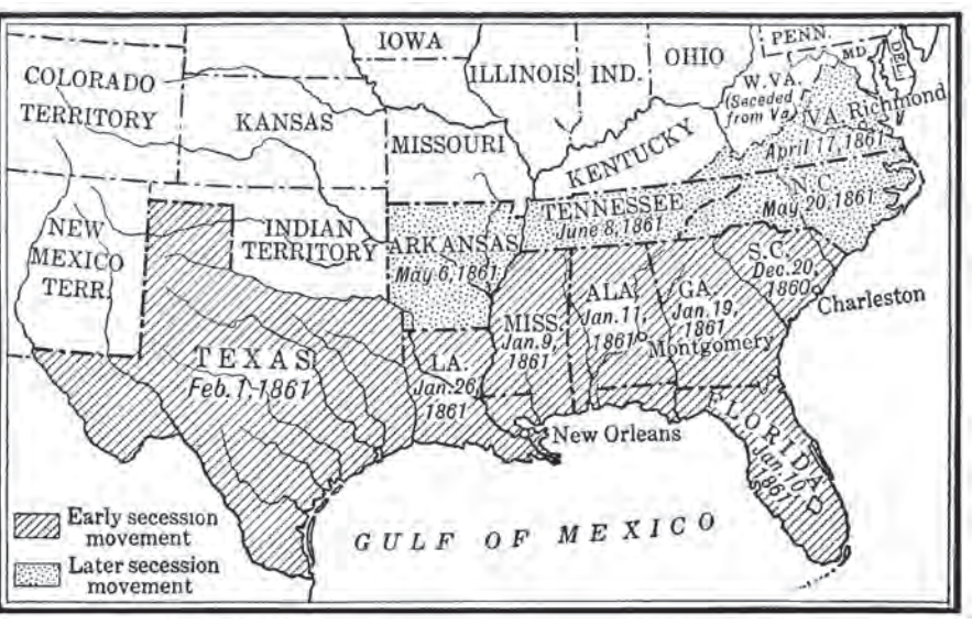
The Confederate States