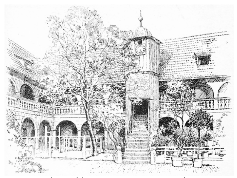
Cloister of the Augustinian Monastery in Erfurt

himself immensely with his friends, among whom he was a favorite; for he was a young man of high intellectuality and many pleasing qualities. In the midst of the fun, he broke the news of his decision to his friends with these words: "Friends, today you see me for the last time; I have decided to become a monk." They thought he was joking. When they were finally assured that he was in dead earnest, they did everything in their power to pull him away from his purpose; but they were unsuccessful.