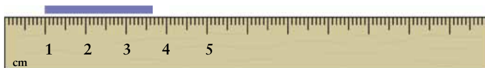
Illustration by Megan Whitaker