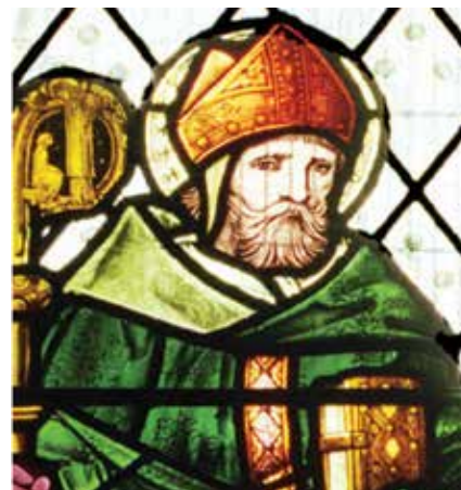
Stained glass window by William Morris (to the designs of Burne-Jones)

Bishop Robert Grosseteste (1175–1253) was an English statesman, philosopher, theologian, and scientist. He was one of the first scientists to establish a framework for what would later become the scientific method. Besides being a great scientist, Grosseteste was a strong Christian. He taught that the purpose of inquiry was not to come up with great inventions, but instead to learn the reasons behind the facts. In other words, he wanted to explain why things happened the way they did. That's the essence of science. He said that "just as the light of the sun irradiates the organ of vision and things visible, enabling the former to see and the latter to be seen, so too the irradiation of a spiritual light brings the mind into relation with that which is intelligible" (Stevenson 1899, 52).