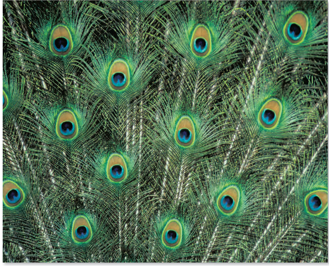
Bob Fine © 1999