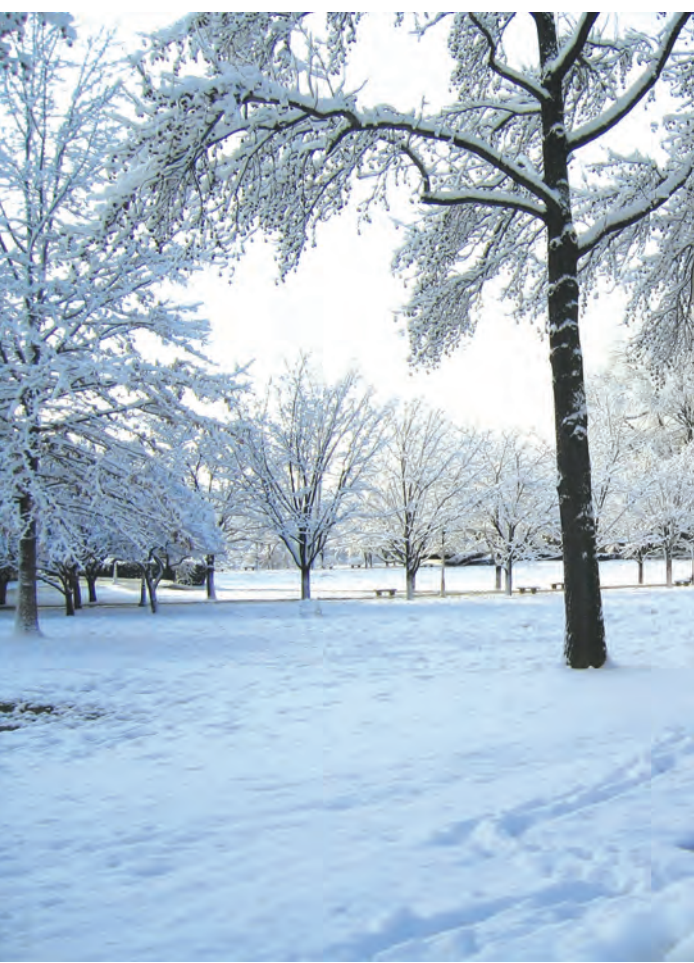
Benjamin Hollis CC BY 2.0

The days of winter are colder than the other seasons. Plants rest or grow very slowly during the winter. The sun does not shine as strongly during wintertime. The trees, grass, and other plants rest and wait for spring to come.