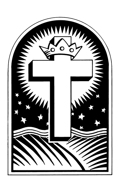
Christian Liberty Press Arlington Heights, Illinois